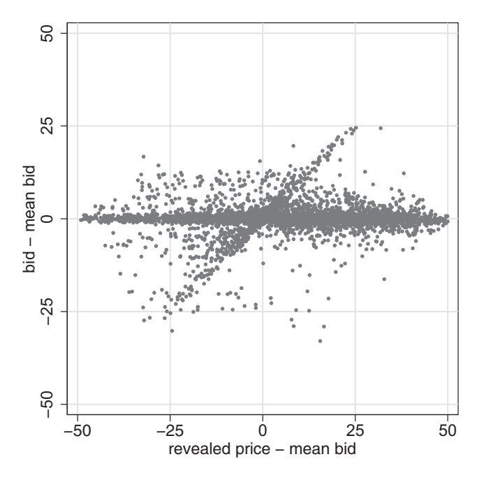
Figure 3. Scatter plot of bid against revealed price, both centered on the mean bid that the subject placed for the respective good over the course of the experiment.

revealed price separately for each good and each subject (this means running three regressions for most subjects and two or one regression[s] for those who finished the experiment before they got a chance to bid on all three goods). In these individual regressions, 48% (41%) of the subjects showed a significant pos-